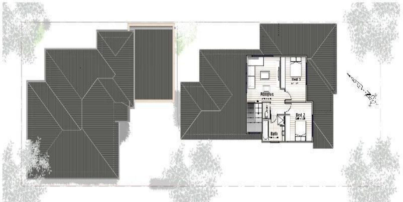
19 Kent Street, Mornington