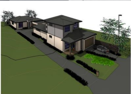
1/19 Kent Street Mornington