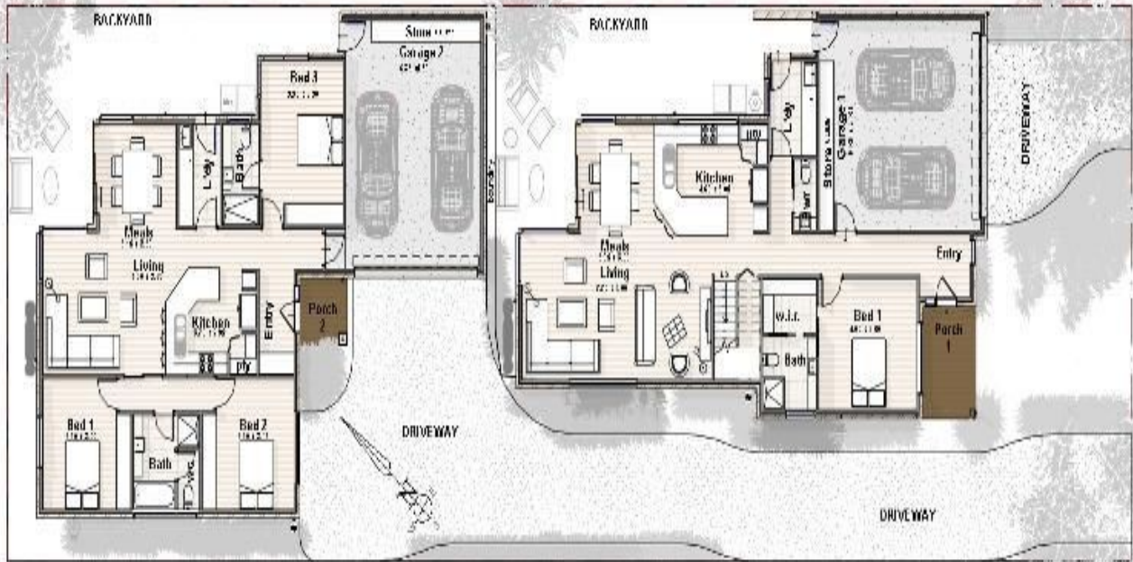
19 Kent Street, Mornington