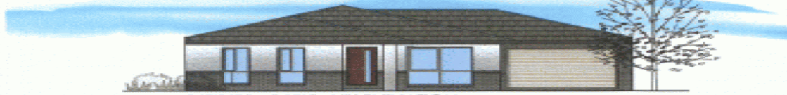
TYPE D - OPTION B ELEVATION